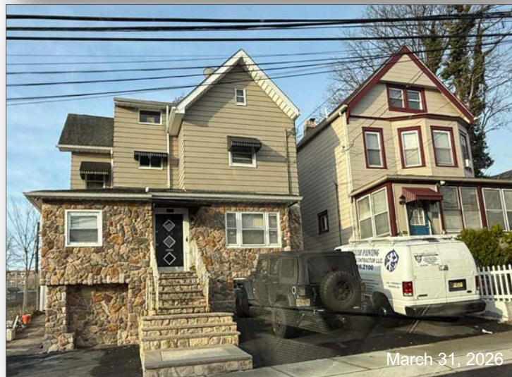
Photo #5: View of the detached dwelling located to the west of the subject site, fronting on the southern side of Parkinson Terrace.