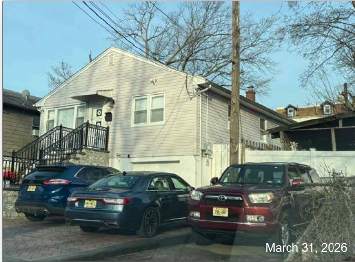
Photo #4: View of the property located to the immediate south of the subject site, fronting on the western side of Baldwin Terrace.