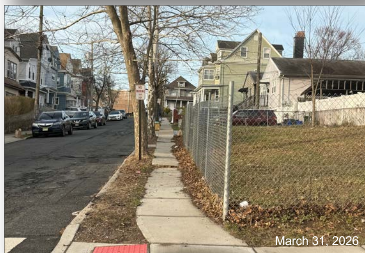
Photo #3: View of the property located to the immediate east of the subject property, fronting on the southern side of Heywood Avenue.