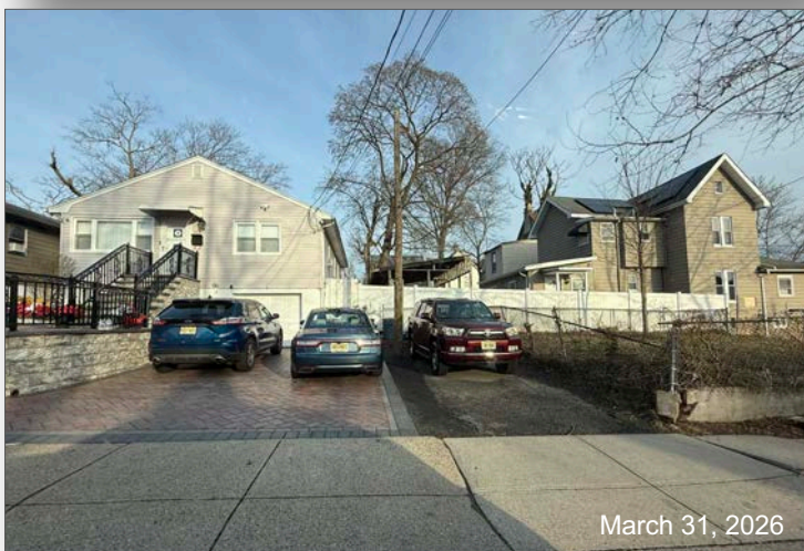
Photo #2: View of the rear of the subject site from the southeast on Baldwin Terrace Avenue.