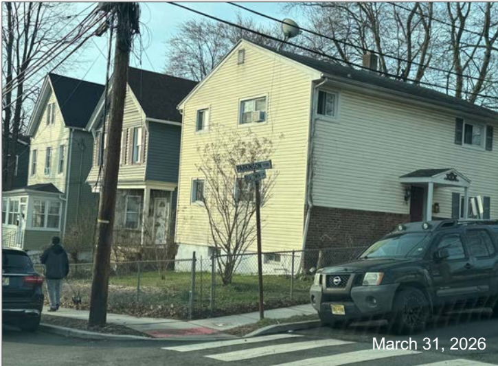
Photo #7: View of properties located to the east, across Baldwin Terrace from the subject site.