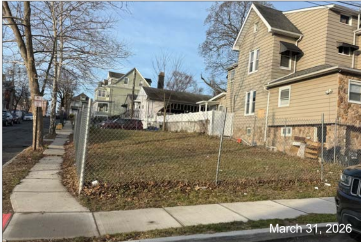
Photo #1: View of the subject property located at 434 Parkinson Terrace. The applicant proposes to construct a new two-family dwelling on this undersized site.