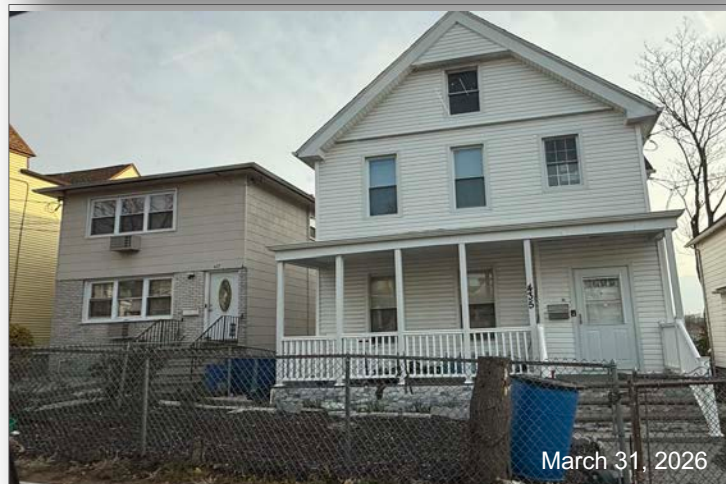
Photo #6: View of properties located to the north, across Parkinson Terrace from the subject site.