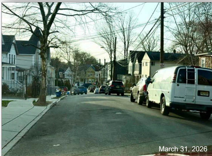
Photo #8: View looking east on Parkinson Terrace, towards High Street.