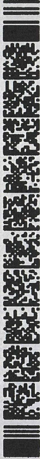
PLATE NO: X57NXJ GOOD THRU: 05/2025