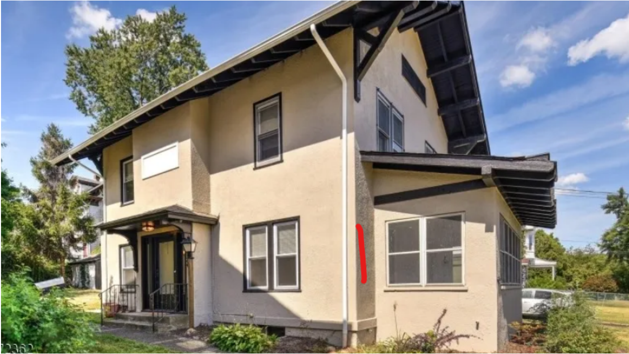
436 New England Terrace – Replace 5 windows, same size, same style, same color as existing, no structural change. Proposed windows are Simonton 6100 Series style vinyl windows.