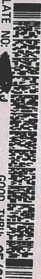
PLATE NO: [REDACTED]

ASALL CHIEF ADMINISTRATOR MOTOR VEHICLE COMMISSION