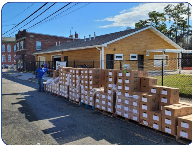
Cartons of food getting ready to be delivered to the Orange Food Pantry in the West Ward arrive at the new, multi-purpose Field House