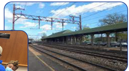
Construction at the train station is one of the many redevelopment projects happening in Orange