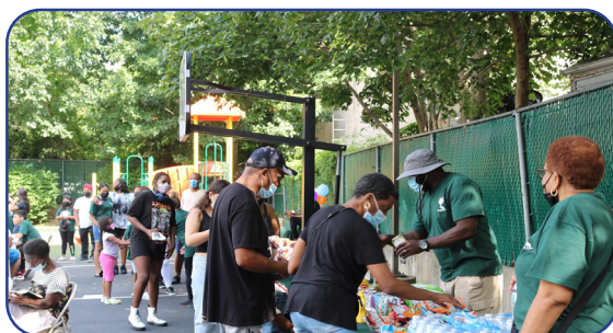
A fabulous day for families at the Forest St. Community School's Kick-Off