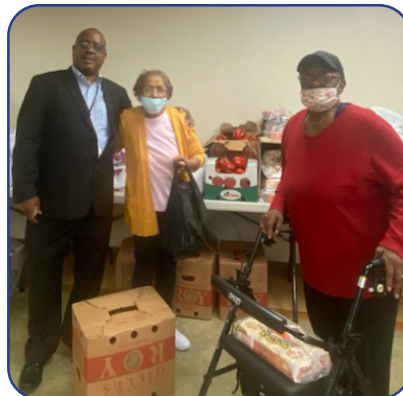
Helping to distribute food at the Senior Building at 340 Thomas Boulevard