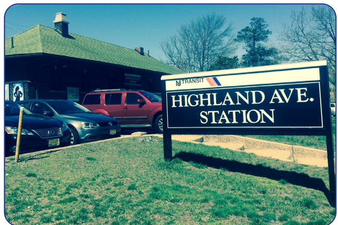
The Highland Avenue Station in Orange along the Essex and Morris lines