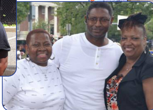
Meeting with residents at the Central Playground