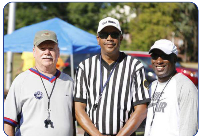
Annual Stop the Violence 3 on 3 basketball tournament